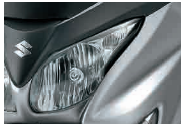
Cool Silver (W6V)