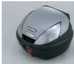
Top Case 37L*

*Coloured cover to be ordered separately.