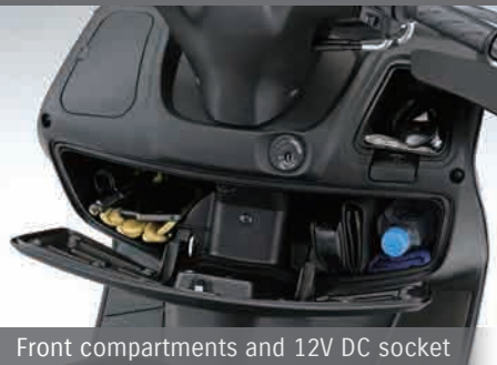
Front compartments and 12V DC socket

Life with the BURGMAN is a four-letter word: EASY. Please, want for nothing. After all, you've got the space to carry a briefcase, a gym bag, or an extra helmet for a friend. Accept no compromises. The BURGMAN 200 is big enough to make its presence felt in rush-hour traffic and sleek enough to slip through an alley for a shortcut home.