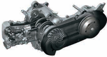
BURGMAN 200 Engine & transmission

*Measured by Suzuki in the Worldwide Motorcycle Test Cycle (WMTC mode) exhaust emissions measuring conditions. Actual fuel economy may differ owing to differences in conditions such as the weather, road, rider behavior and maintenance.