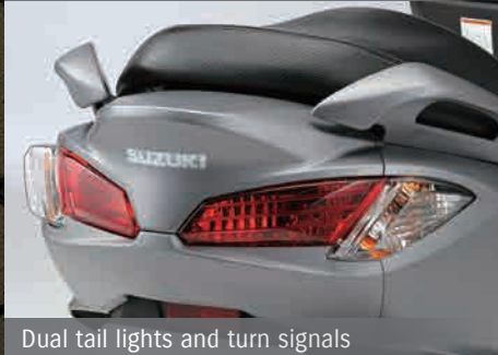
Dual tail lights and turn signals

Sharply styled dual headlights have a bold, elegant look and ensure an excellent view of the road ahead.