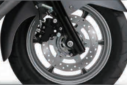
Front & rear disc brakes, optional ABS

A large windscreen helps keep you comfortable by shielding you from wind, insects, and road debris. Vent duct located at bottom of windscreen reduces wind turbulence and increase comfort.