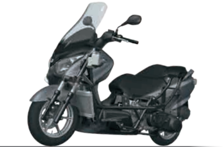
Chassis and suspension

240mm front disc with 2-piston caliper and 240mm rear disc with single piston caliper provide efficient braking performance. Front and rear disc brakes with an optional Antilock Brake System (ABS)*. The system monitors wheel speed, and matches stopping power to available traction.