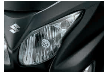
Metallic Mat Black No.2 (YKV)