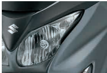
Metallic Mat Fibroin Gray (PGZ)