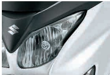
Brilliant White (YUH)